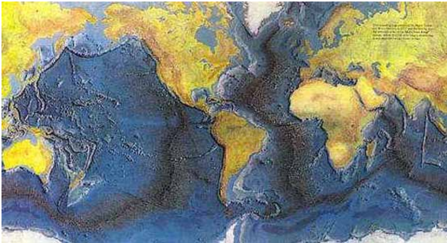
Figure 1. Ocean floor structure, spreading ridges and subduction trenches shown in darker blue. Note Iceland to the east of Greenland (white due to ice cover) directly on the Mid Atlantic Ridge.

Every geologist, oceanographer and atmospheric scientist knows that Earth's plate tectonic system, oceans and position in the solar system play the major roles in our climate. These forces are inevitable and uncontrollable. Among scientists, serious discussions regarding potential global climate change take as understood these powerful, long-term, planetary scale forces rule, thus anything that might be happening to the climate in the short term of a human lifespan is relatively minor. But somewhere along the way, some scientists became disingenuous—they realized they could influence both politicians and the public by preying on their collective ignorance of earth science, and the inherent inability of the untrained mind to fully grasp the enormity of geologic time and astronomical distances. These predominantly left-leaning scientists now have the ability to influence global politics and economic development by peddling the mantra of man-made global warming.